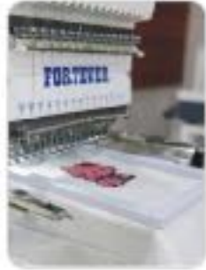
◎ 八合一磁铁绣框 8 in 1 magnetic frame