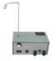
绕线器 bobbin winder