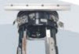
帽驱动 cap driver