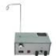
绕线器 bobbin winder