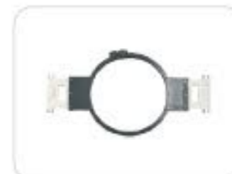
1 x round hoop 20cm