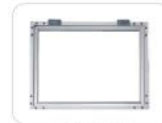
Aluminum frame except FT-1201(300 x 350)

1 x aluminum frame, except FT-1201(300 x 350) 1 x oval hoops 58 x 36cm 2 x square hoops 30 x 30cm 2 x round hoops 19cm 2 x round hoops 15cm 2 x round hoops 12cm 2 x round hoops 9cm