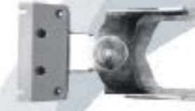
鞋绣 shoes device