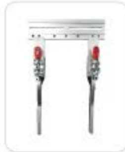
Easy robot frame