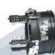
帽圈 cap ring