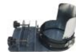
帽座 cap station