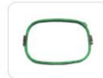
58 x 36cm