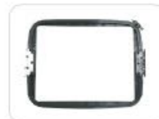
1 x rectangular hoop 32 x 24cm