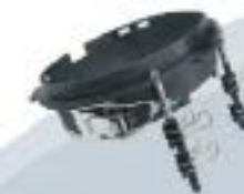
帽圈 cap ring