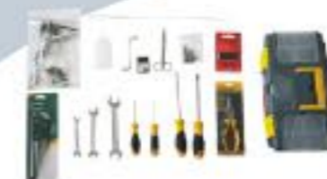
工具箱 tool kit

Tool kit Operation Manual Table and stand with wheels Bobbin winder