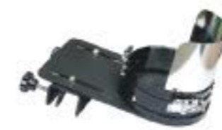
帽座 cap station

帽座一套 帽圈两个 270度帽驱动一套 1 x cap station 2 x cap rings 1 x cap driver