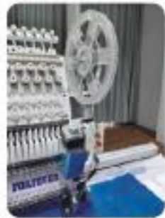
◎ 单金片 Single sequin device