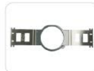
1 x round hoop 12cm