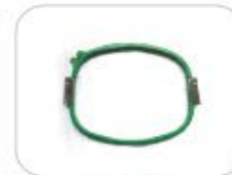
30 x 35cm only for FT-1201(300 x 350)