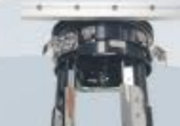
帽驱动 cap driver