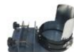
帽座 cap station