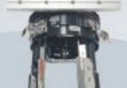
帽驱动 cap driver