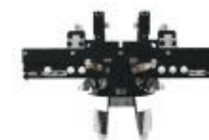
帽驱动 cap driver