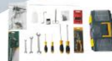
工具箱 tool kit