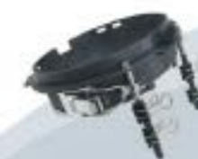
帽圈 cap ring