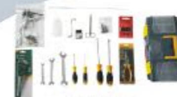
工具箱 tool kit