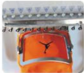
◎ 鞋夹 Robot frame