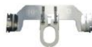
袜框 socks device