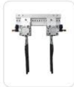
Pneumatic robot frame