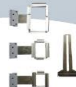
磁力绣框 magnet frame