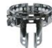
帽圈 cap ring