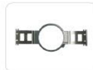
1 x round hoop 15cm