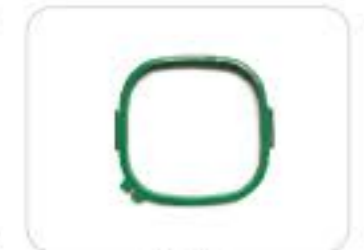
30 x 30cm