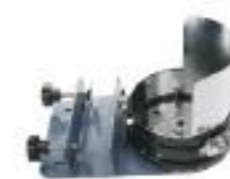
帽座 cap station