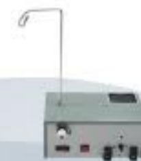
绕线器 bobbin winder