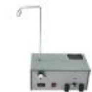
绕线器 bobbin winder