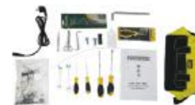
工具包 tool kit