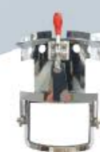
口袋框 pocket frame