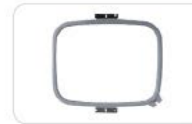
40x40cm per head for FT-1201HC/1202HC 31x39cm per head for FT-1203HC/1204HC